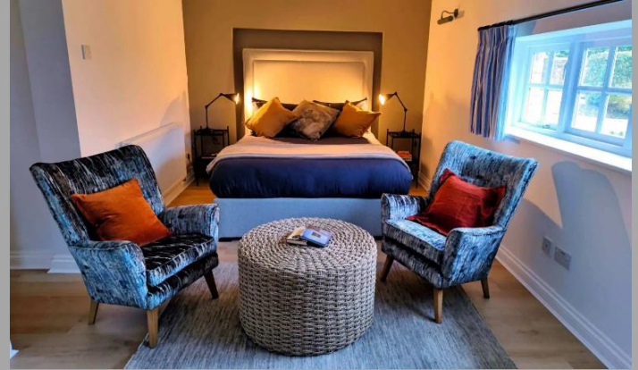
5 Superior Bedrooms

All of our standard bedrooms come with a double bed & en-suite