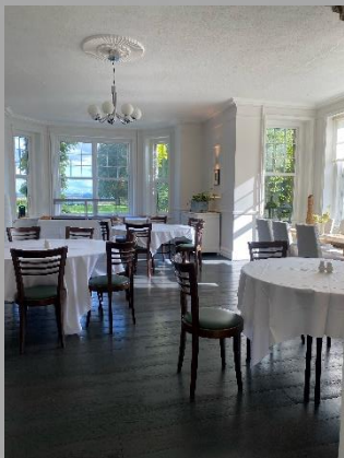
Table de Hote

At Middle Aston House, we understand that no event is complete without a great meal, and a couple of drinks. There are a number of offers available to be tailored to your event