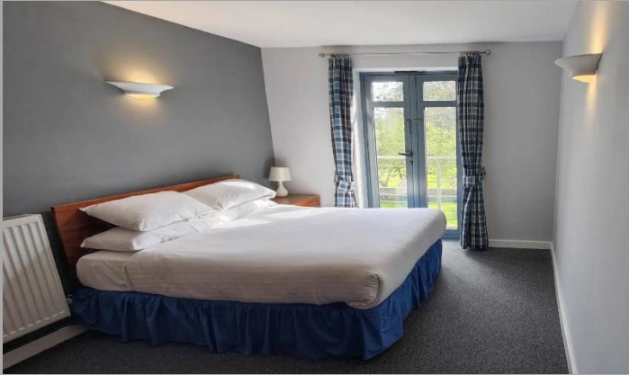
48 Standard Bedrooms

Middle Aston House has 55 en-suite double bedrooms across the site. To book, contact the house directly on the numbers below.